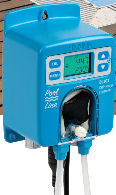
ORP Controller and Dosing Pump