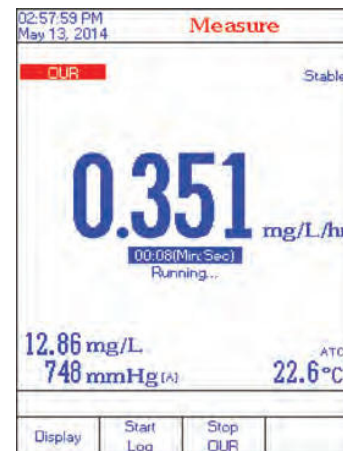
OUR (Oxygen Uptake Rate)