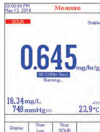
SOUR (Specific Oxygen Uptake Rate)